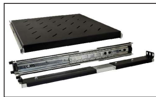
shelf with guides