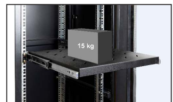
shelf loading capacity