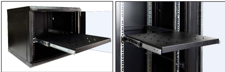
Full-extension slide of the shelf