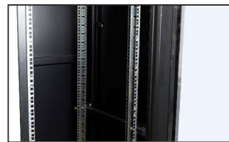
empty RACK 19" cabinet