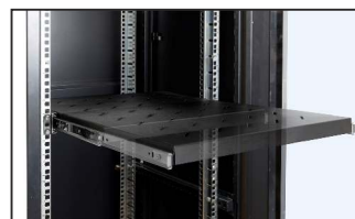
full-extension slide of the shelf